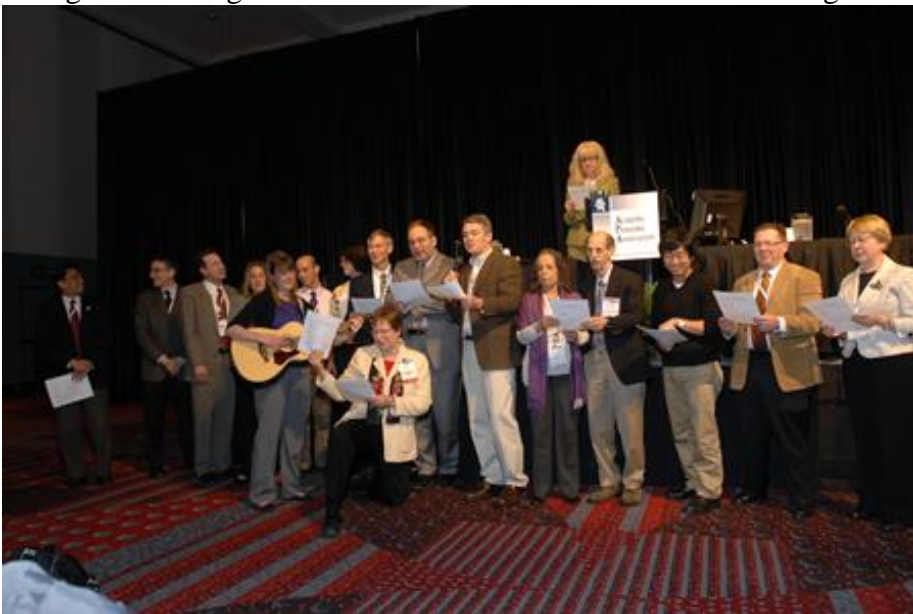
APA Board singing

APA Membership Meeting and Debate Photo Slideshow